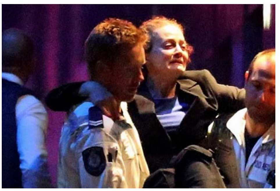
A Wounded Sydney Hostage

One of the jarring aspects of this whole tragedy is that