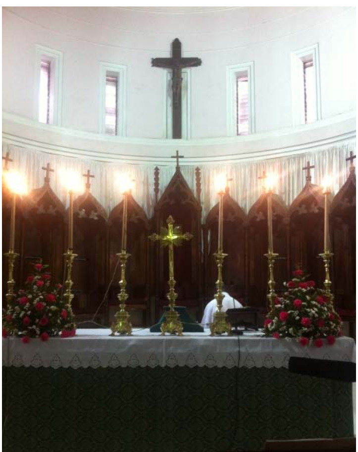
The Anglican Cathedral, Dar es Salaam

I began my time in Dar es Salaam meeting with three priests for two days at the Cathedral, during which time we discussed the situation in the Diocese and national church and the need for continuing formation and education for the clergy. Among the main insights for establishing this school was that their best resources would not be books or programs but people. Personal visitation to parishes by speakers identified as being especially gifted in specific