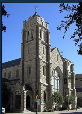
St. Andrew's Church

(There are a few rooms available for Sunday and Friday nights for those who wish to arrive early or stay on.)