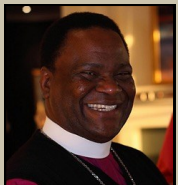
Abp. Valentino Mokiwa (Tanzania)